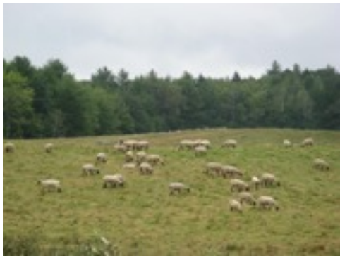
Ewes gazing at Colyerbrook Farm, this 300 year old sheep farm has been returned to sheep farming.

http://www.pressherald.com/life/foodanddining/marching-to-the-bleat-of-a-different-drummer_2012-08-22