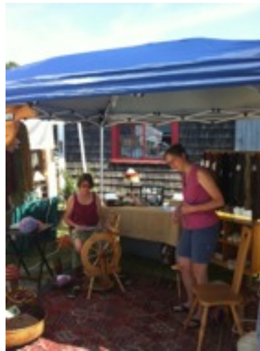
Art Day at Wolfe's Neck